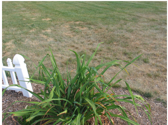
This portion of a Kentucky bluegrass/perennial ryegrass lawn on a very shallow soil has entered summer dormancy due to drought.

During an extreme and persistent drought, it is possible that some cool-season grasses may die and require reseeding in the fall. This may be acceptable to those looking to conserve water during summer months or may be necessary because of water use restrictions during a drought. Again, where warm-season grasses are adapted within the state, consider using them because they can better withstand most drought conditions. Researchers at Virginia Tech continue to evaluate a new generation of “water-saver” grasses, and drought tolerance is part of the selection criteria used in developing the annual Virginia Turfgrass Variety Recommendations list that can be found on the Virginia Cooperative Extension website ( www.pubs.ext.vt.edu ).