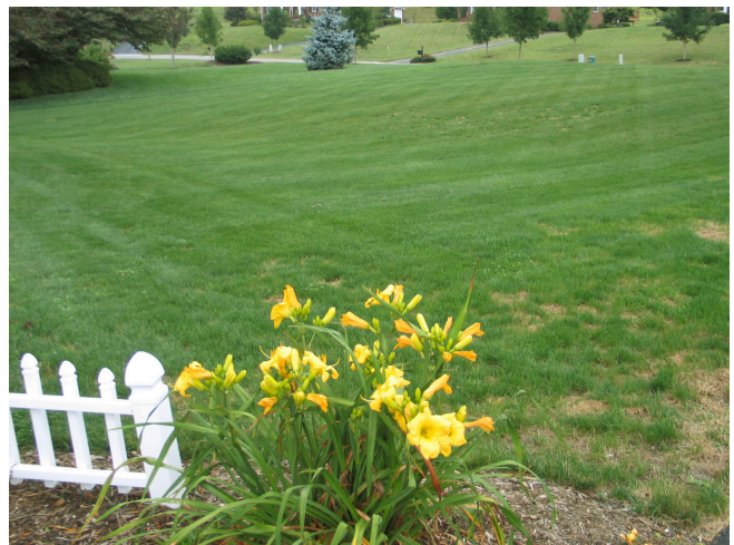
Following one-half inch of rain, there is a dramatic recovery in color and growth of the bluegrass/ryegrass lawn over a one-week period.