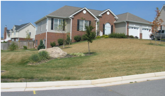
Turfgrasses enter dormancy during severe drought as a survival mechanism.

Overwatered lawns frequently lead to excess blade growth, summer fungal diseases, and more frequent mowing. Excessive watering also wastes water and increases the risk of fertilizer and pesticide runoff from the lawn to paved surfaces. This could negatively impact local water quality. Lawns that receive little to no water from irrigation or rainfall during summer months will go dormant. Grass blade coloring will lighten. Most lawns will recover when water returns.