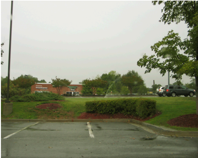
Irrigation during a rainfall event wastes water and suggests the irrigation system and turf are not being properly monitored.

water by rainfall, irrigation may not be needed. Pay attention to current weather conditions and forecasts in order to use water more responsibly. Nothing is more wasteful (and more likely to attract negative attention) than seeing irrigation running in the rain!