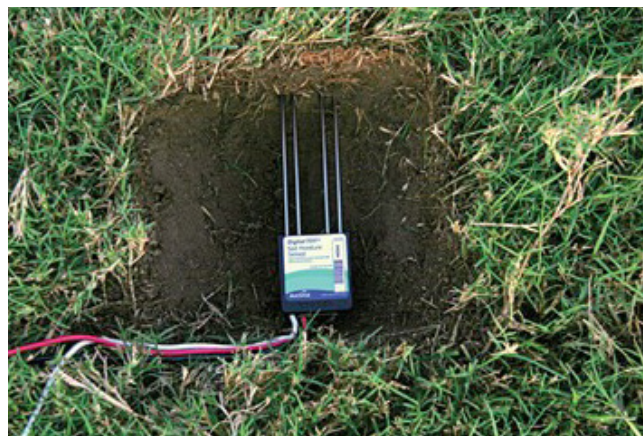
Properly calibrated soil moisture sensors predict the moisture requirements of lawn and landscape plants and are excellent additions to irrigation systems.