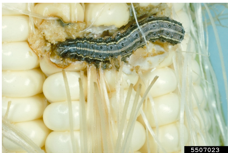
Figure 4 Fall armyworm damaging a corn cob.

host range with over 80 plants recorded, but clearly prefer grasses. The field crops frequently injured include alfalfa, barley, Bermudagrass, buckwheat, cotton, clover, corn, oats, millet, peanuts, rice, ryegrass, sorghum, sugarbeets, sudangrass, soybeans, sugarcane, timothy, tobacco, and wheat. Among vegetable crops, only sweet corn is regularly damaged. Other vegetable crops attacked include crucifer crops. Weeds known to serve as hosts include bentgrass, Agrostis spp.; crabgrass, Digitaria spp.; Johnsongrass, Sorghum halepense ; morningglory, Ipomoea spp.; nutsedge, Cyperus spp.; pigweed, Amaranthus spp.; and sandspur, Cenchrus tribuloides . There is some evidence that FAW strains exist based primarily on their host plant preference. One strain feeds principally on corn, but also on sorghum, cotton, and a few other hosts if they are found growing near the primary hosts. The other strain feeds principally on rice, Bermudagrass, and Johnsongrass.