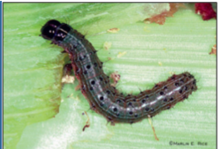
Figure 1b Early instar fall armyworm

Identification: Larvae are hairless and smooth skinned and vary in color from light tan or green to dark brown (nearly black). Three yellowish-white lines traverse the sides and back from head to tail and four dark circular spots are evident on the upper portion of each abdominal segment. The front of the head is marked with a prominent inverted white Y, but this characteristic is not always a reliable identifier.