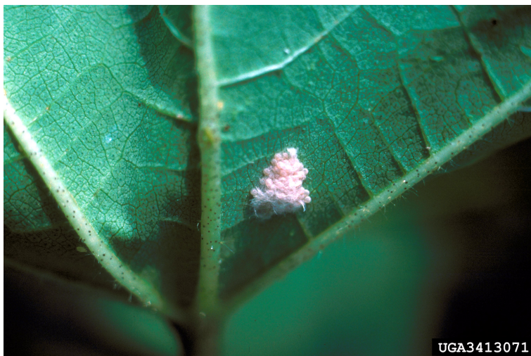
Figure 3 Fall armyworm egg mass

Host plants: FAW feed on a wider range of plants than do true armyworms, Pseudaletia unipuncta (Haworth) (Lepidoptera: Noctuidae). The FAW is a major pest of sweet corn, tomatoes, and peppers in Virginia and other southeastern states. However, FAW have a wide