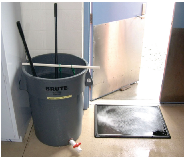
Simple net sanitation and footbaths are important biosecurity measures.

Developing a biosecurity plan is essential for all types of production systems. Care should be taken to minimize cross-contamination between ponds or tanks by sanitizing harvest gear such as seines, waders, nets, and hauling tanks; personnel access should be limited.