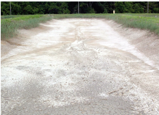
Proper design of ponds and levees will allow easy access for harvesting and will drain completely to provide for sun drying and disinfection.

Good aquaculture practices in pond design provide for adequate levee height and width to accommodate required production and harvest equipment. Ponds should have adequate depth to maintain seasonal water-quality parameters and thermal stability while minimizing seasonal stratification from a minimum of 3 feet on the shallow end to a maximum of 8 feet at the deep end. Pond levee slopes of at least three to one (3 feet wide for every 1 foot in elevation) are recommended to reduce wind-induced erosion and facilitate harvesting. Ponds should also have graded bottoms that are higher than discharge waters to allow for complete drainage as part of pond bottom mud and organics management. Ponds should have adequate levee height to absorb documented heavy rain episodes. For surface water locations, intake structures should be upstream of