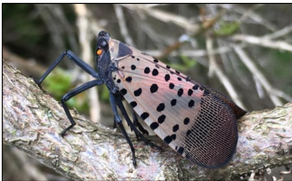
Figure 1. Adult spotted lanternfly.

SLF (Fig. 1) is a serious pest of grapes and other crops. SLF is not considered a direct threat to conifers such as Christmas trees as it prefers a wide range of deciduous trees and plants. However, many of these preferred host plants can be found on and around Christmas tree farms.