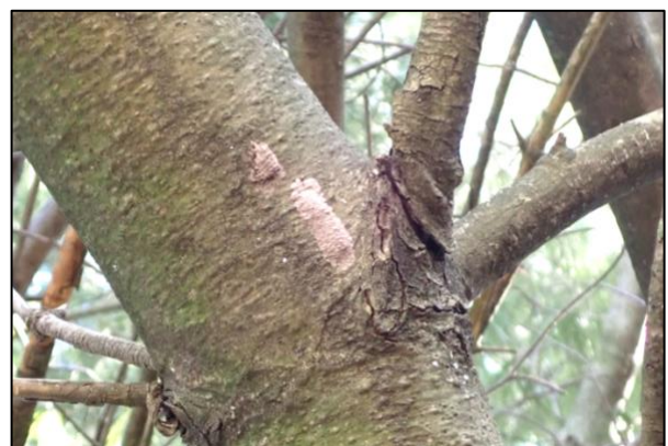
Figure 2. Light-colored spotted lanternfly egg masses along the trunk of eastern white pine.

There is a slight risk that fresh Christmas trees may harbor SLF egg masses. Customers can be reassured that should an egg mass hatch in the home, the nymphs will not survive inside due to the heat and lack of moisture in the air. SLF nymphs found indoors can be killed easily by physical crushing, drowning in soapy water, placing in hand sanitizer, or with an aerosol insecticide. In the unlikely event that a SLF egg mass or nymph is found on a Christmas tree, the homeowner should contact the local Cooperative Extension office to report the find.