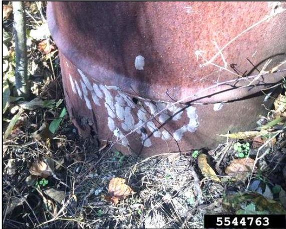
Figure 3. Light-colored spotted lanternfly egg masses clustered at the bottom of a rusty metal drum.

The Virginia Department of Agriculture and Consumer Services (VDACS) encourages all agricultural producers to do their part to watch for SLF and avoid human-assisted transportation of this pest across the state. Every Christmas tree farm operating in or near the quarantine area or any known infested areas should take precautions to prevent moving SLF.