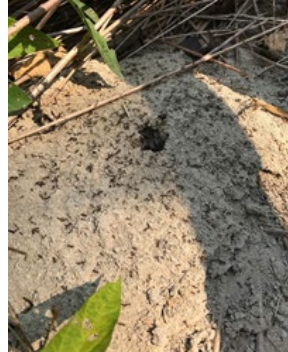
Figures from top: VDACS quarantine map, https://www.vdacs.virginia.gov/pdf/fire-ant-quar-map.pdf ; RIFA adult, Pest and Diseases Image Library, Bugwood.org; fire ant mound (2 photos) by Eric Day.