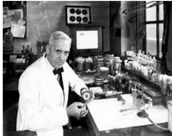
Sir Alexander Fleming in his laboratory

However, less than a century after Fleming's discovery, antimicrobial resistance (AMR) is threatening how well antibiotics work. For these drugs to be preserved, it is critical to understand what AMR is and why we should all care.