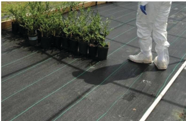
Figure 2. Store plants on easy-to-clean surface such as weed mat over well drained gravel.