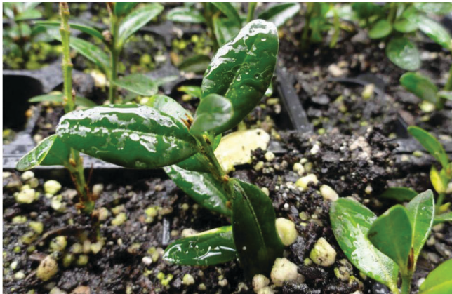
Figure 5. When using overhead irrigation, water plants so as to reduce leaf wetness period.

boxwood blight; only partial resistance is available. Contact your local county Extension office for a list of the more resistant cultivars.