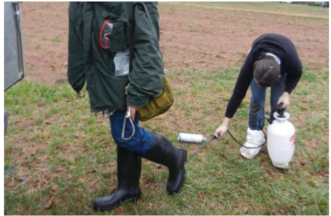
Figure 3. Clean and sanitize boots between hoop houses or display blocks.