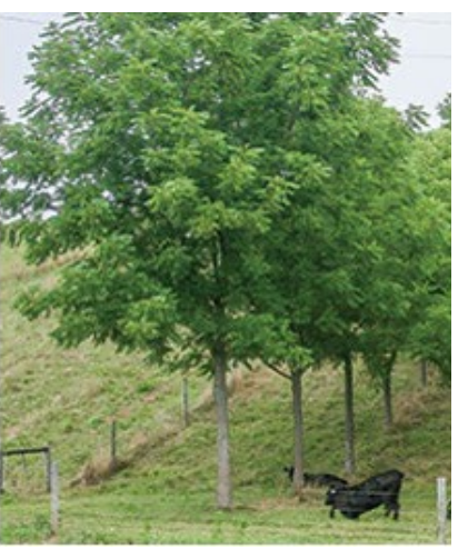
Black Walnut is a popular silvopasture tree because of its open canopy, deep taproot, rapid growth rate, nut production, and valuable timber.

Soil Moisture – The amount of water regularly available in a soil can dramatically affect the growth and long-term survival of most plant species. Four moisture designations are included in this guide – wet (W), Moist (M), Dry (D), and well-drained (X). Determine the moisture level of your soil by observing the soil in the spring and fall, as well as during and after rainfall.