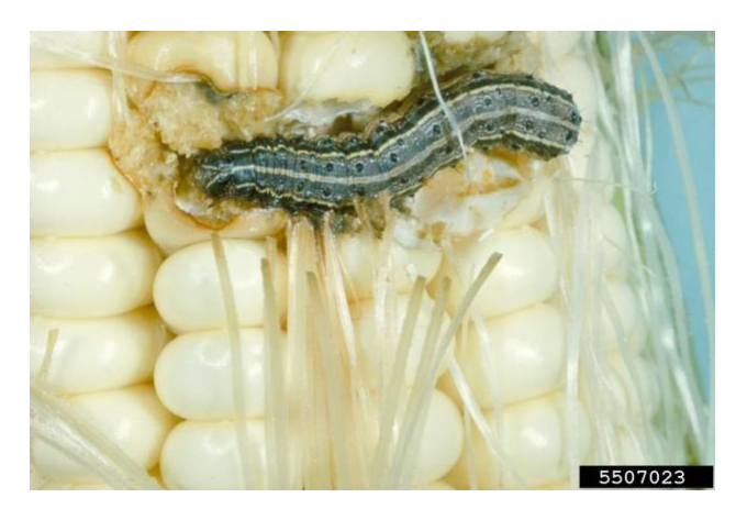
Figure 5. Late instar fall armyworm larva feeding on corn kernels