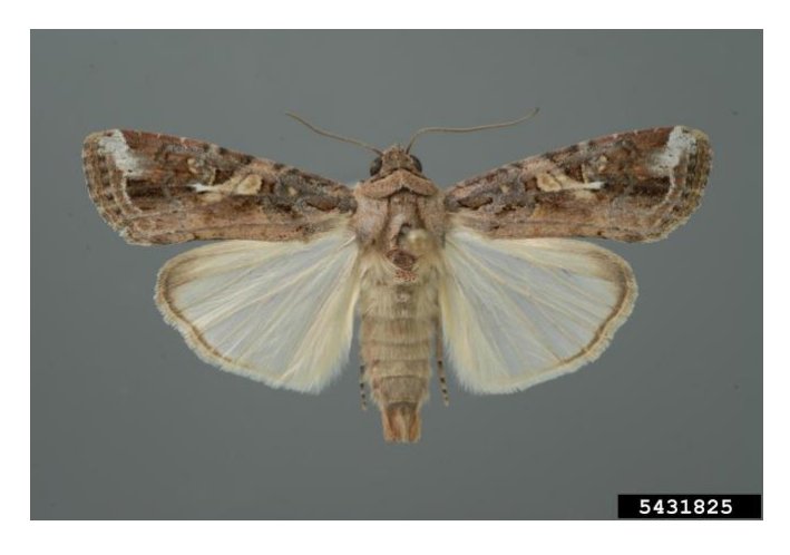
Figure 2. Fall armyworm adult male moth (Lyle Buss, University of Florida, Bugwood.org).

Larvae vary in length from 1/2 in (2mm) as first instar larvae to 3/4 - 1 in (35 - 50mm) as mature larvae. The forewing of adult male moths is generally shaded gray and brown, with triangular white spots at the tip and near the center of the wing (Fig. 2). The forewings of females range from a uniform grayish brown to a fine mottling of gray and brown. The hind wing is iridescent silver-white with a narrow dark border in both sexes (Fig. 2).