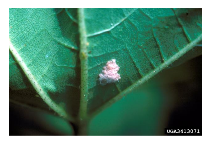
Figure 3. Fall armyworm egg mass on the underside of a cotton leaf

Seasonal FAW activities in Virginia begin with egg laying by moths migrating northward from their ranges in the southern United States and Mexico. The moths persistently migrate and lay eggs throughout the summer. Female FAW moths can produce approximately 1,000 eggs over her life span, and deposit them in clusters containing up to four hundred eggs each (Fig. 3). New generations can occur approximately every 30 days depending on conditions (Barfield et al. 1978; Ashok et al. 2021). Neonates produce a silken thread, which allows them to drop or be blown (aka ballooning) to other areas. In Virginia, FAW are most active in the late summer/fall (See Fig. 4), beginning in early July. Caterpillars can cause severe damage and will eventually move into adjoining fields. They feed more during daylight hours than other armyworms and large populations can rapidly lead to severe damage.