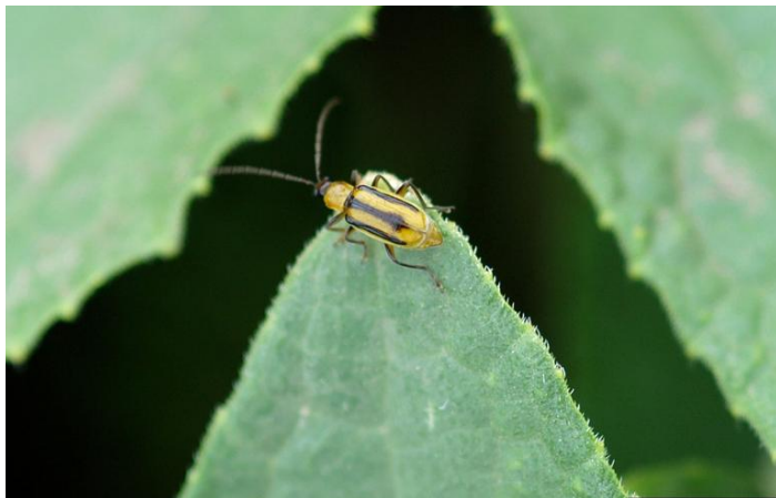
Figure 1. Adult western corn rootworm (WCR, Diabrotica virgifera virgifera LeConte).

The western corn rootworm (WCR), Diabrotica virgifera virgifera LeConte, is the most economically damaging pest of corn ( Zea mays , L. Poaceae) in the United States, including Virginia. WCR larvae survive exclusively on corn roots, making annual crop rotation the standard and most effective tool for management. Some WCR populations have developed behavioral adaptations to avoid crop rotation 1 , however this has not occurred in Virginia. Additionally, insecticide resistance to some chemicals and transgenic proteins used for WCR management have been documented 1,2 , and resistance to control measures is an ongoing concern. WCR costs U.S. growers an estimated $1 billion in annual control costs and yield losses annually. Control costs, resistance development, and several documented cases of cultural control evasion make WCR a pest of focus for corn growers across the U.S.