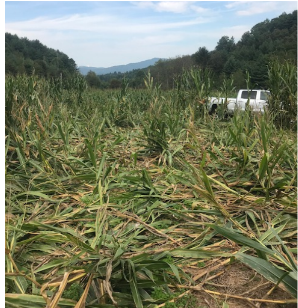
Figure 5. Lodging caused by WCR larvae feeding on roots near Clyde, NC in 2018.

WCR larvae can cause severe economic damage to corn. Larvae tunnel into corn roots and feed on plant tissue. Yield may not be affected if the population of WCR is low, however entire roots can be pruned off during severe infestations. Since corn plants rely on sturdy root systems to remain upright, severe infestations by WCR can cause plants to lean or fall over, known as lodging (Fig. 5). Photosynthetic potential is reduced in leaning plants 11 , therefore leaning plants produce considerably lower yield than plants that are upright; plants that fall over may not be harvestable at all. Adult beetles feed on corn pollen, silks, and foliage, but this feeding rarely causes significant damage. Root tunnels left by WCR larvae can be identified if plants are dug up and washed thoroughly with water to remove dirt. Damaged roots can be rated on a 0-3 scale to quantify infestation severity (Fig. 6) 12 .