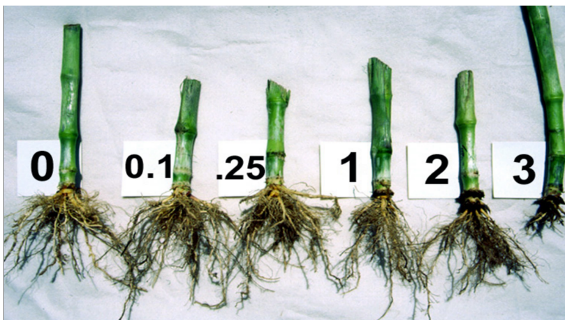
Figure 6. Node injury scale is used to quantify WCR feeding damage, a reliable indicator of infestation severity 12 .