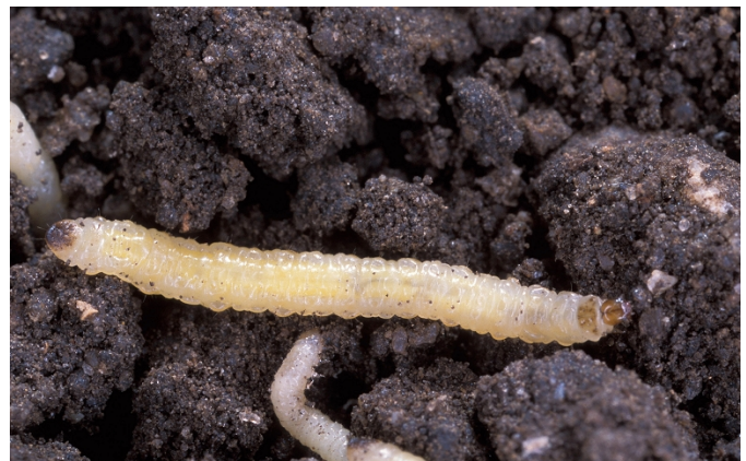
Figure 2. WCR larva.

WCR larvae live beneath the soil, often burrowing into corn roots. First instar larvae are smaller than 3 mm in length, and third instars can reach 12 mm. Larvae have cream-colored bodies, a brown head, and a brown distal end (Fig. 2). WCR larvae are not easily spotted in the field. Larvae hatch in late May or early June, undergo a two week pupation in late June, then hatch into adults by early July 4 .