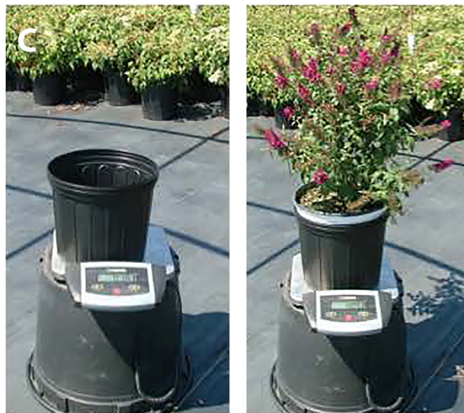
Figure 3. (A) Setup of empty, unplanted container (left) and planted container (right) nested in 5-gallon buckets with holes cut in the lids to measure volume-based leaching fraction. (B) Volume of micro-irrigation water applied by placing spray stake in a 1-gallon milk jug and placing the planted container on pipe ring in a plant saucer (right) to measure volume-based leaching fraction. (C) Weight measurement of solid (no drainage holes) container to catch leachate (left) and planted container nested in leachate-collecting container (right).