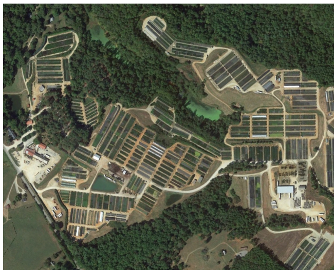
Figure 5. Satellite image of Saunders Brothers, Inc. container nursery from Google Earth. Downloaded Jan. 2019 from Google Earth.

three years. They made adjustments to irrigation based on both short-term (i.e., daily) and long-term (i.e., seasonal) changes in plant water needs. Short-term adjustments dealt with changes in water usage due to weather, specifically temperature, solar radiation, and ET. Long-term adjustments dealt with changes due to crop status, specifically spacing, pruning, and crop age. Through these approaches, the nursery recorded a decrease in chlorine and electricity usage. Also, reduced leaching of nutrients from excess watering, along with a drier substrate surface between irrigation events, decreased weed seed germination. The nursery was able to reduce fertilizer inputs by 25-35% for certain crops and lengthen time between herbicide applications. The cost per LF measurement was estimated to be $1.19 (based on Adverse Effect Wage Rate of $11.46 per hour and 2.5 person hours per week). The nursery measured eight zones each week (three measurements per zone for 24 total measurements) at an estimated annual cost of $1,490. Saunders Brothers estimated that reduced input costs and reduced plant losses due to improved irrigation practices have saved the company in excess of $70,000.