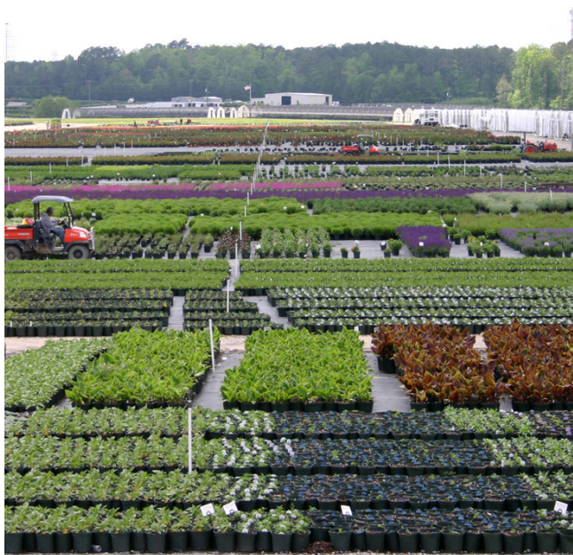
Figure 1. Image of a Mid-Atlantic container nursery.

Irrigation management of nursery crops grown in containers (fig 1.) can be difficult since many factors influence the decision of when and how much to irrigate. These factors include weather, substrate properties, crop water use, crop canopy, irrigation system performance, and water quality. In making the decision to irrigate,