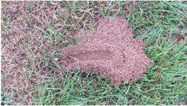
Figure 2. The characteristic 'U-shaped' soil burrowing activity leading to the tunnel of a cicada killer.